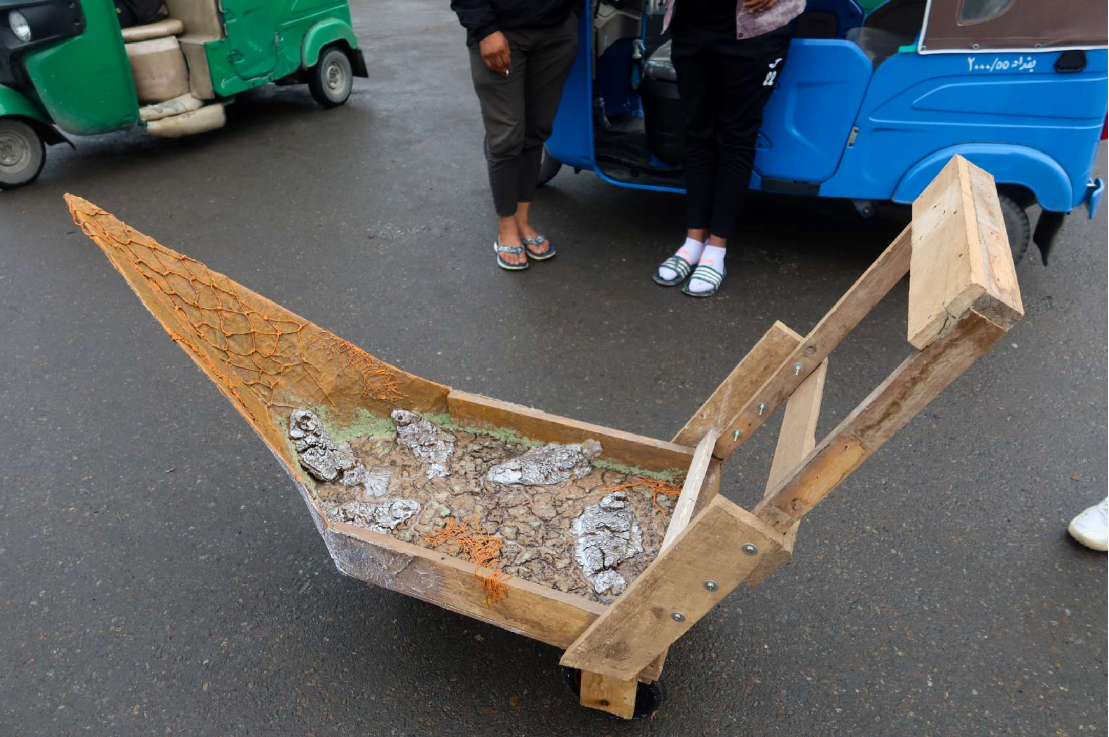
CYCLING Sculpture 2022