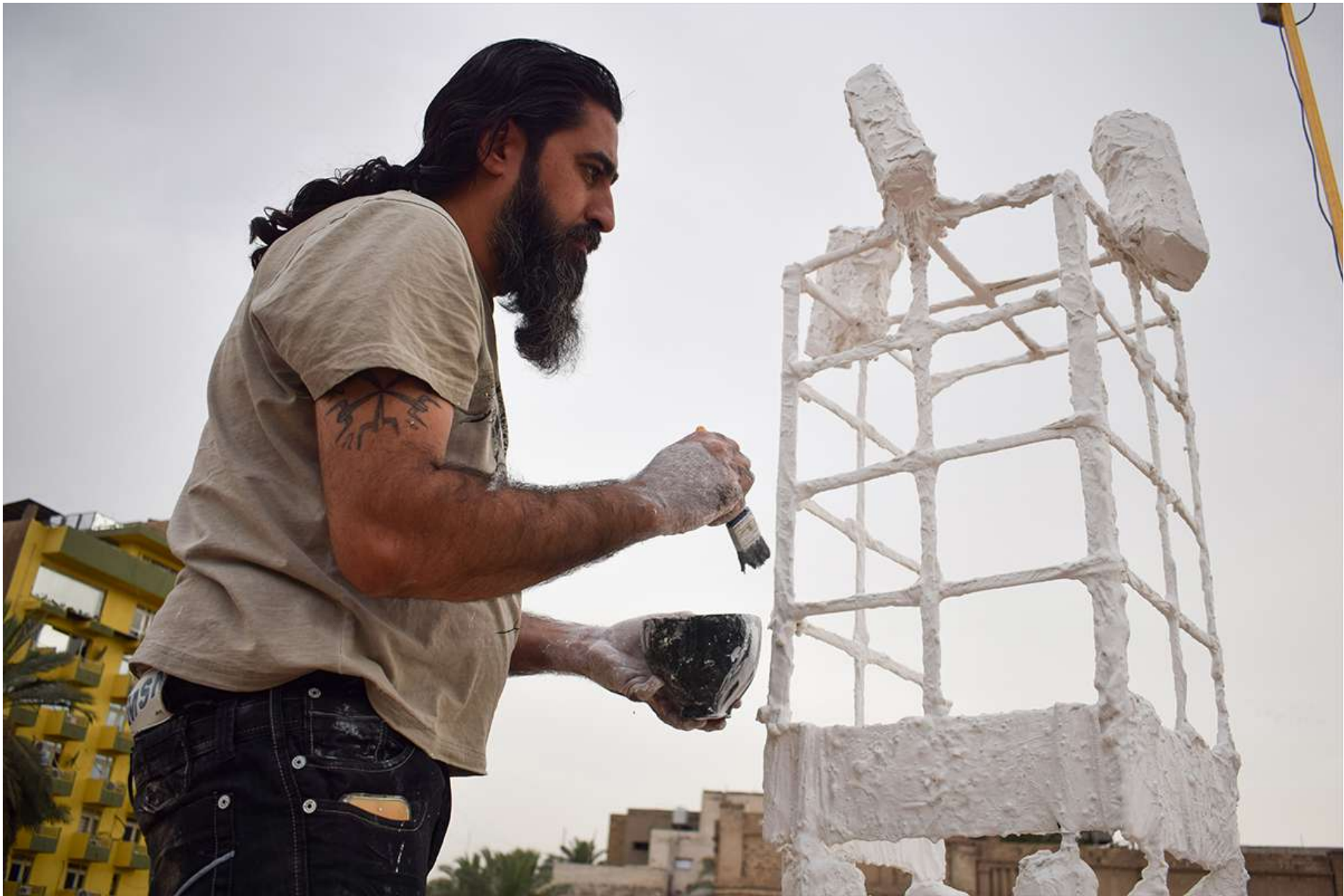
UNION Live-Sculpture Mixed Media 2018