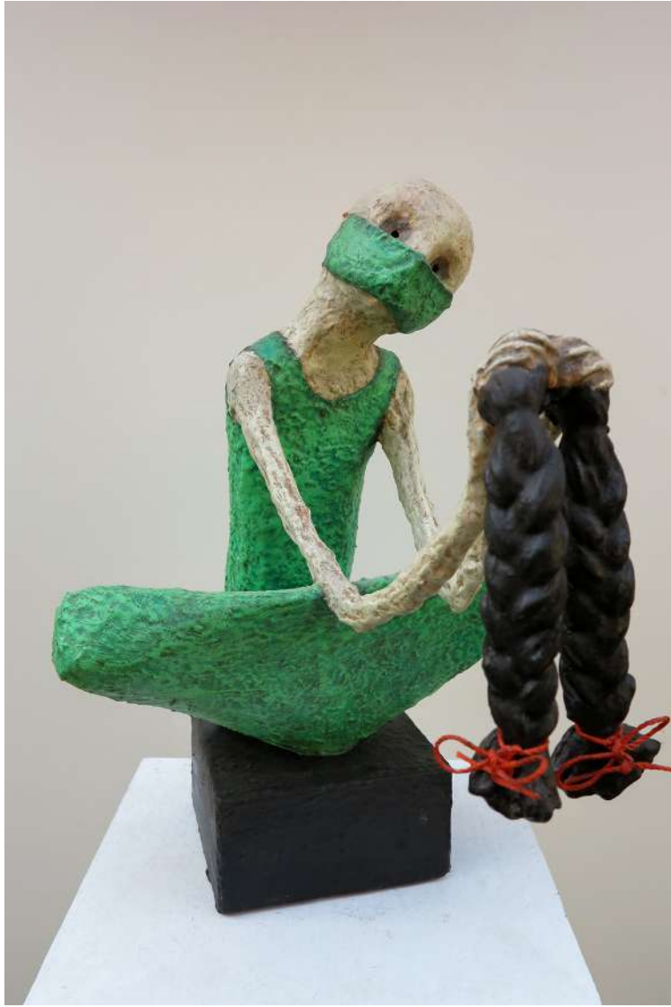
A DOSE OF HOPE Fiberglas | 35 x 45 cm | 2018