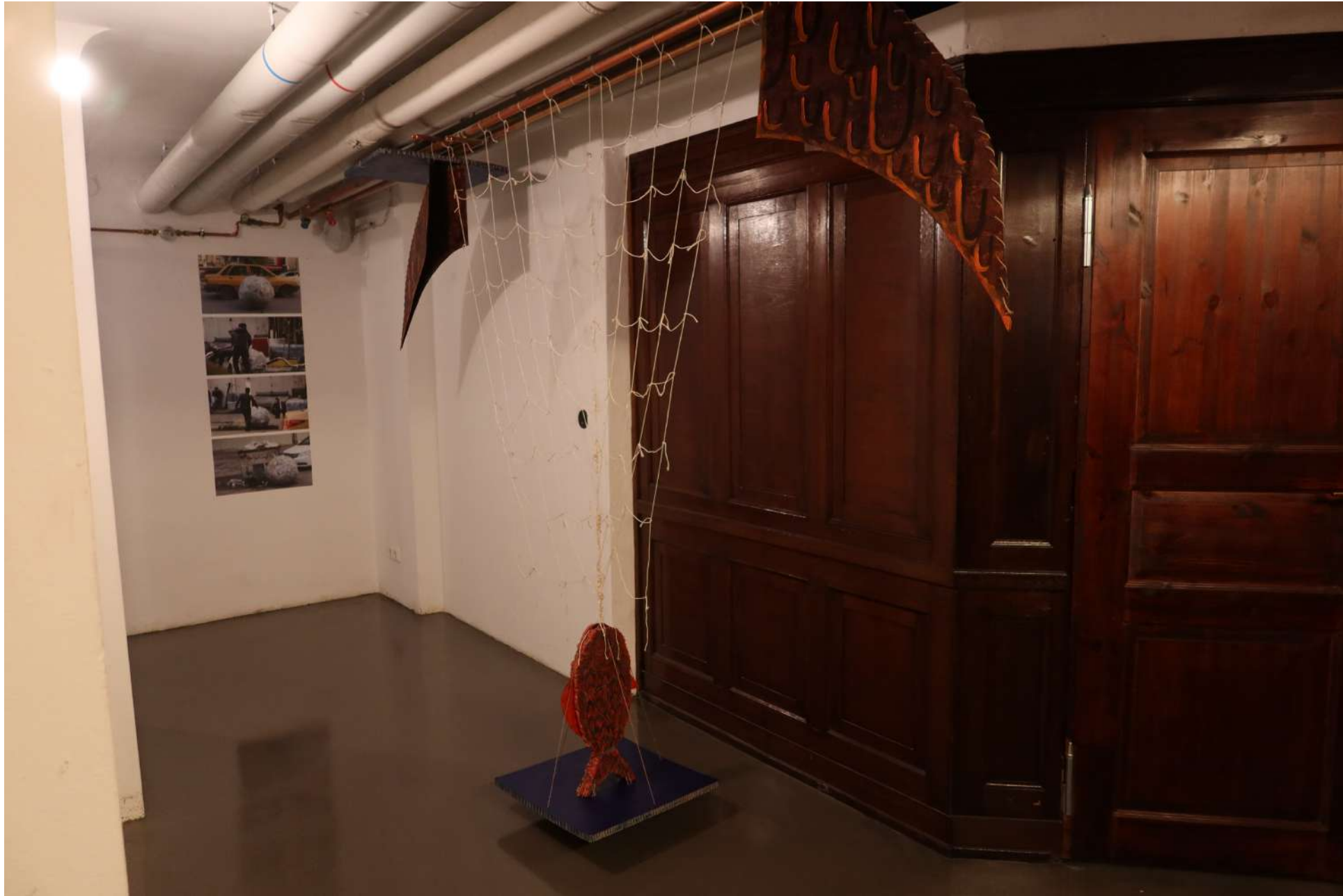
THE OTHER SIDE OF THE RIVER Sculpture, cardboard 2022