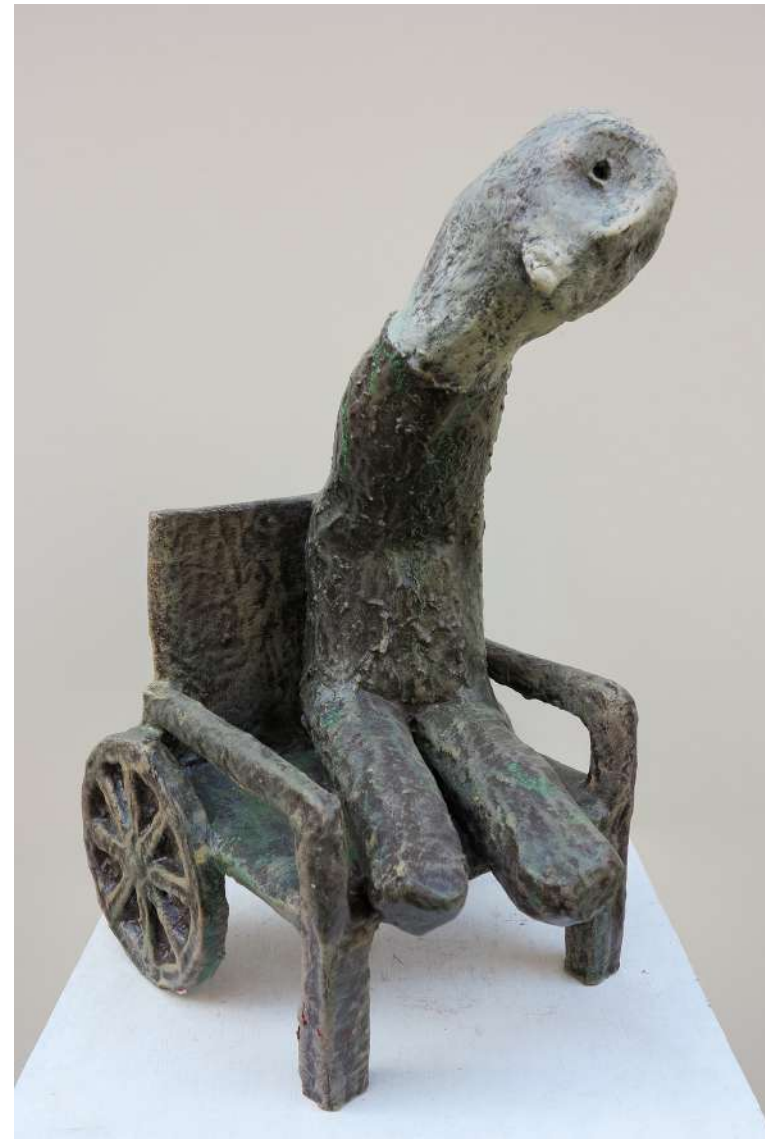
ONE PIECE Fiberglas | 20 x 40 cm | 2018