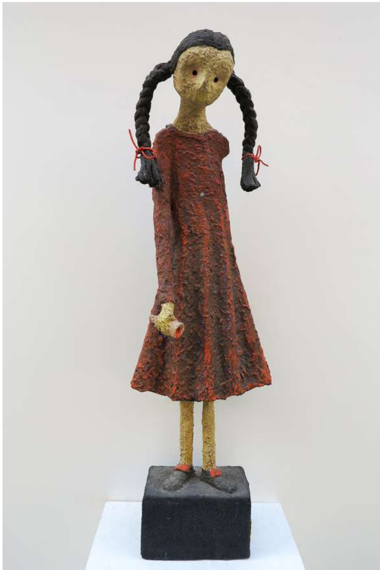
THE LAST FLAVOUR Fiberglas | 20 x 70 cm | 2018