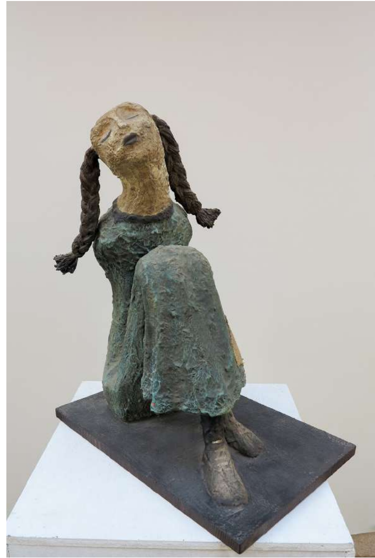
HOMELESS CHILD Fiberglas | 30 x 40 cm | 2018