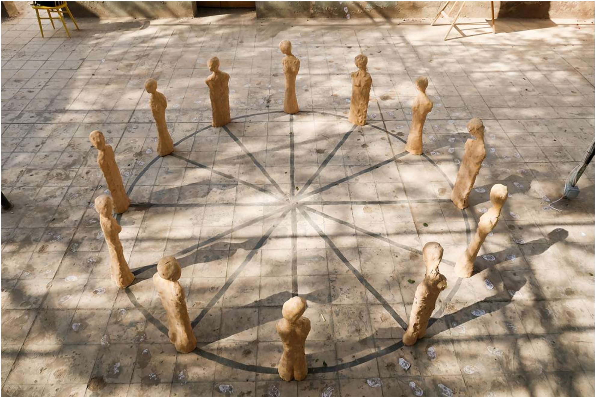
RUMOUR Sculptural Intervention Fiberglas 2019