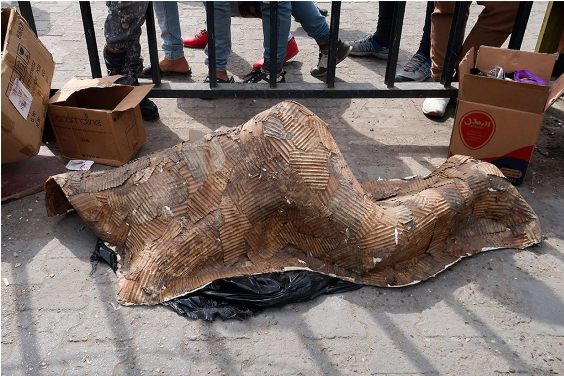
CAMOUFLAGE Pappmaché 2019