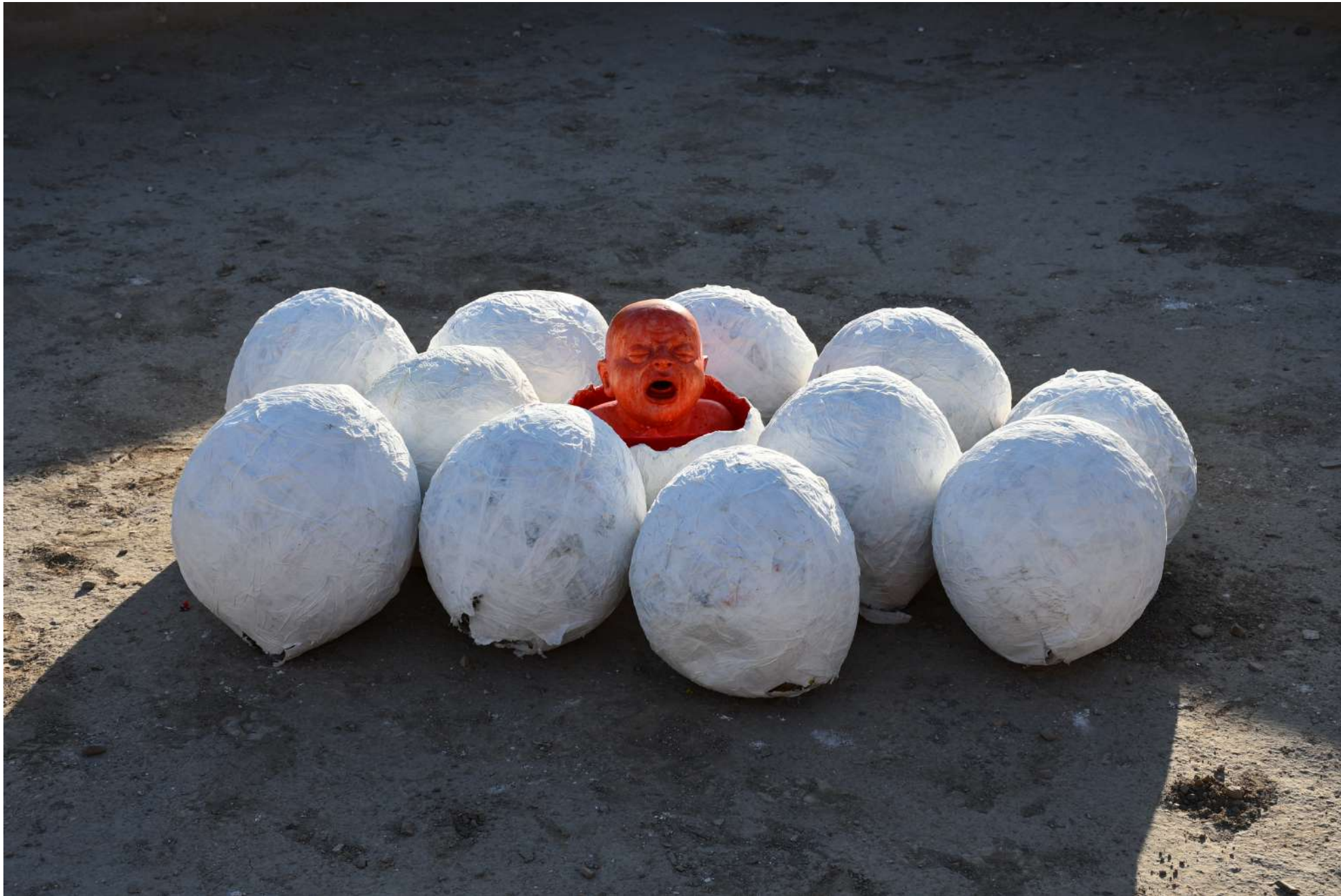
THE NEST Fiberglas, gips 2020