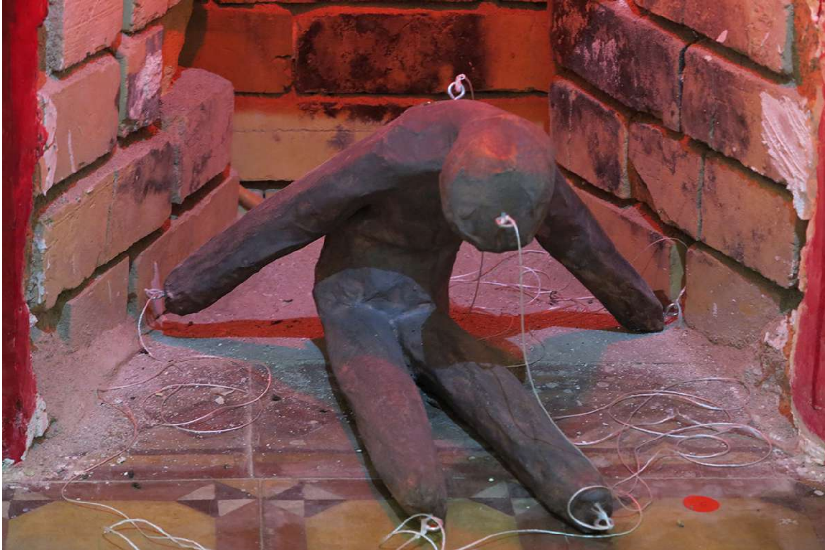
LOST HOPE Fiberglas | 25 x 40 cm | 2018