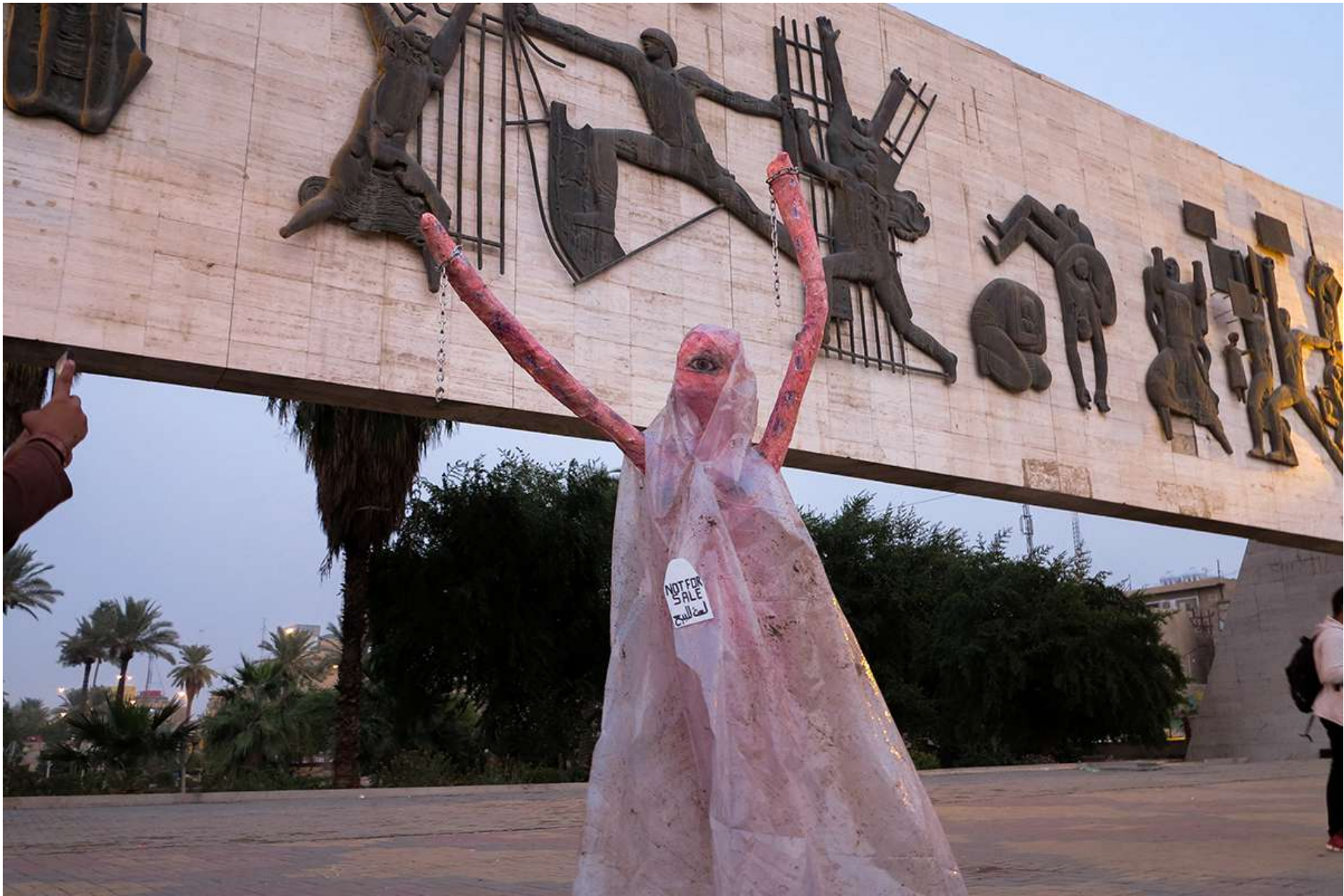
NOT FOR SALE Sculptural Intervention Fiberglas 2018