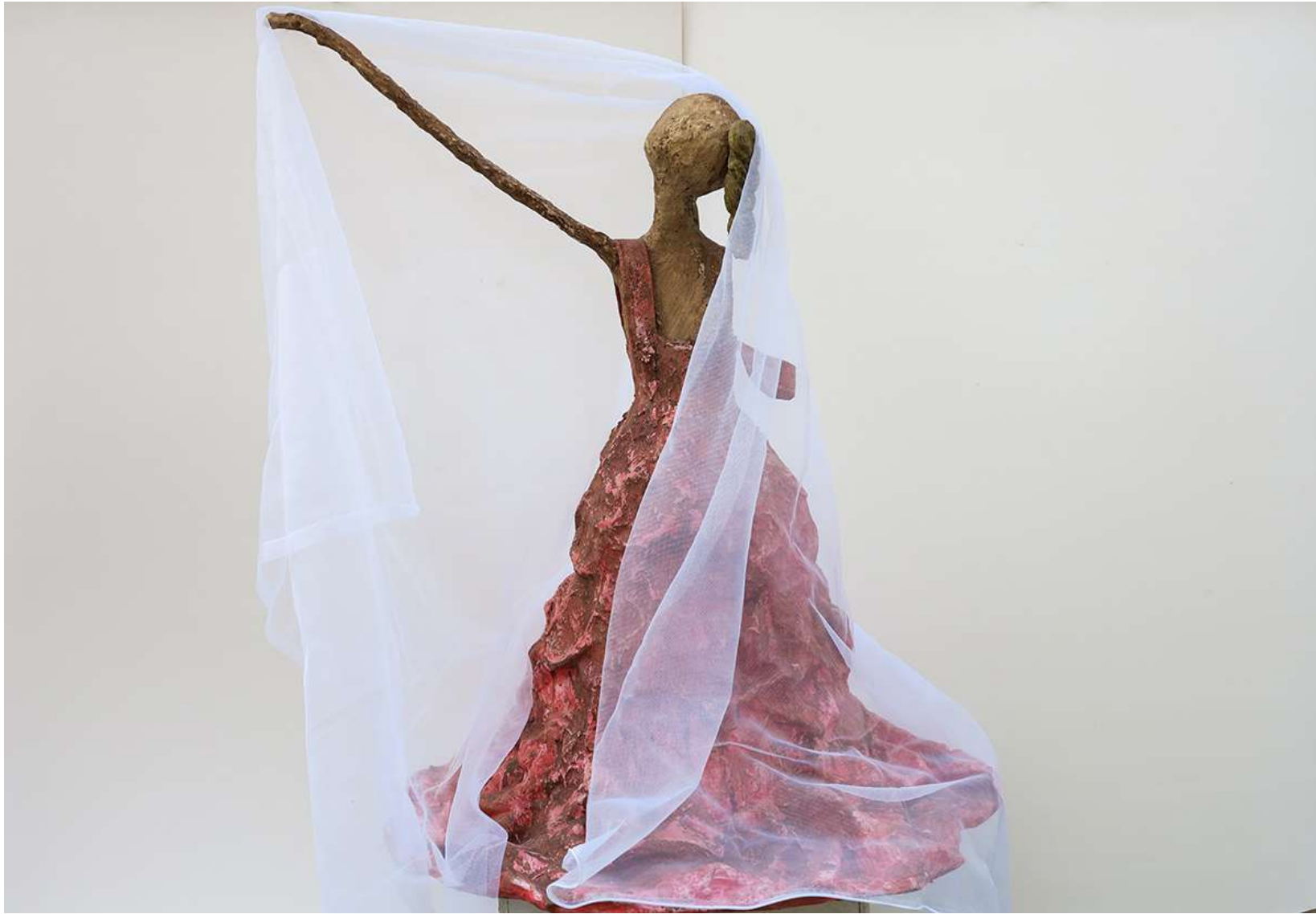
MINORS MARRIAGE Fiberglas | 50 x 70cm | 2018

REMAINS OF REMAINS Solo-Exhibition BAIT TARKIB 2018