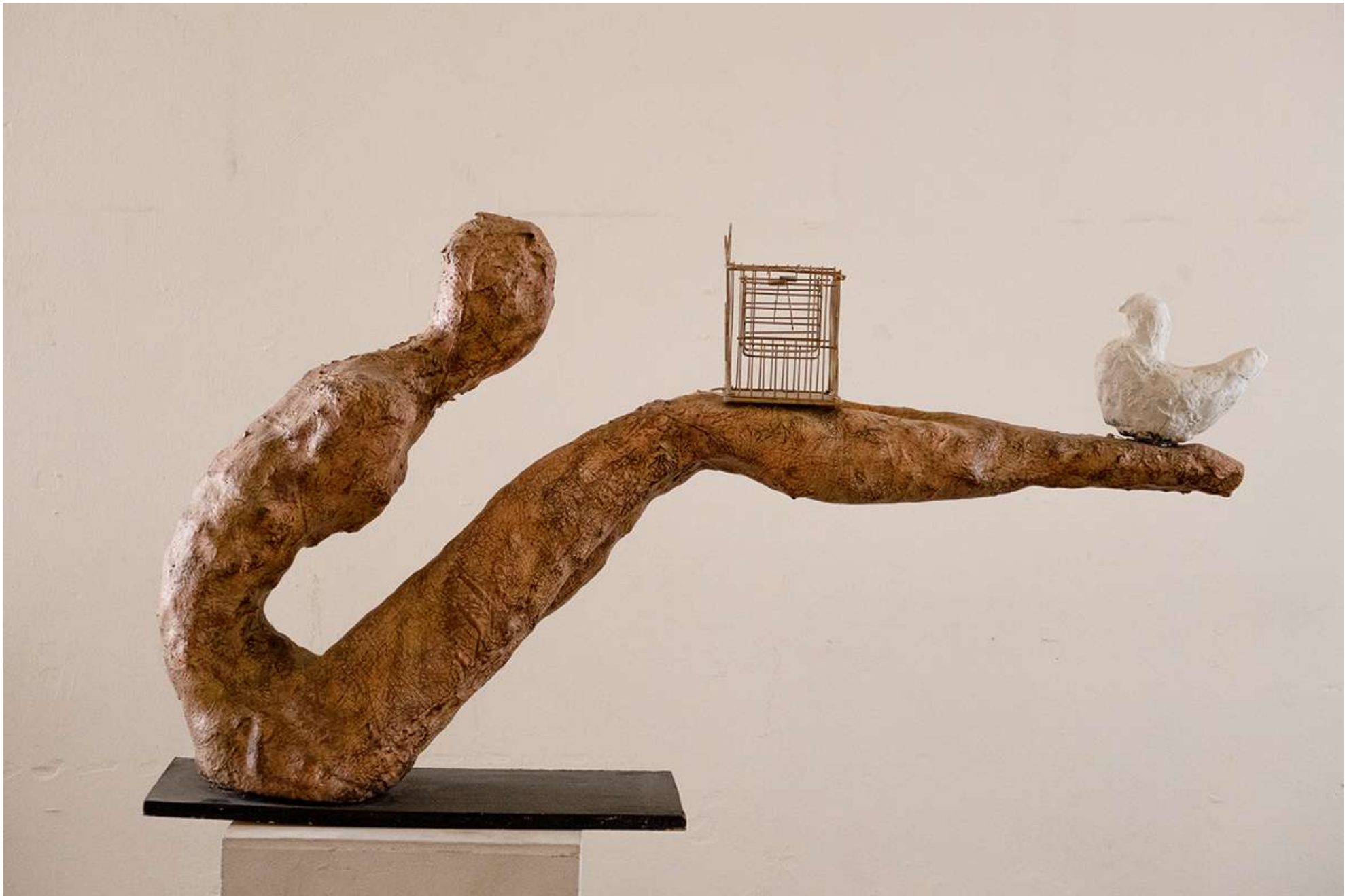
THE OTHER SIDE OF FREEDOM Fiberglas 2019