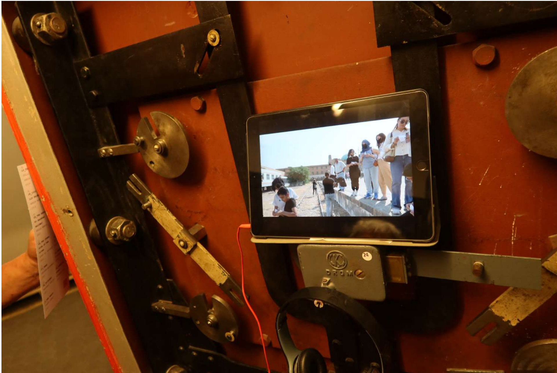
ILLUSION Video of a performance 2022