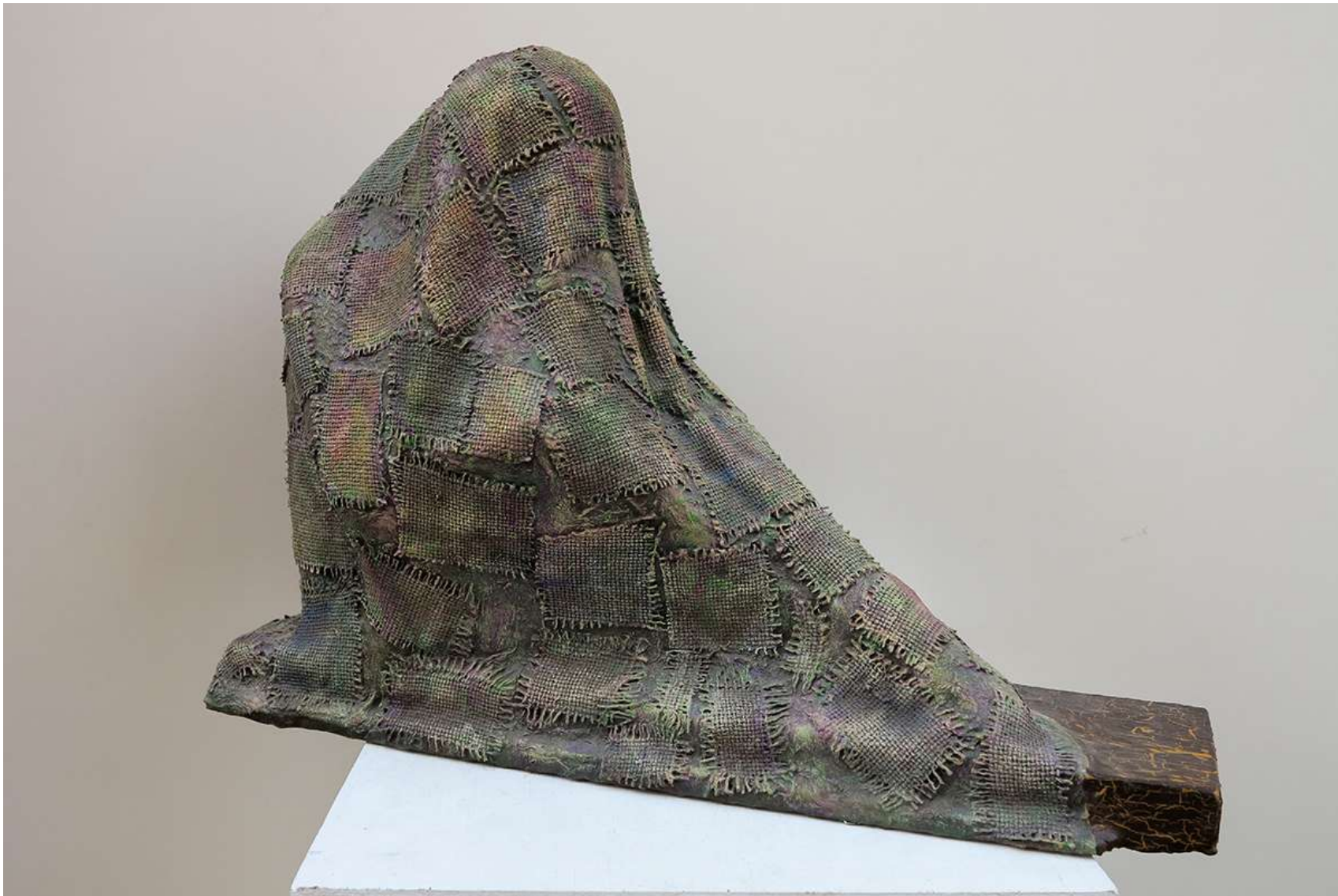
DOMESTIC VIOLENCE Fiberglas | 33 x 45 cm | 2018