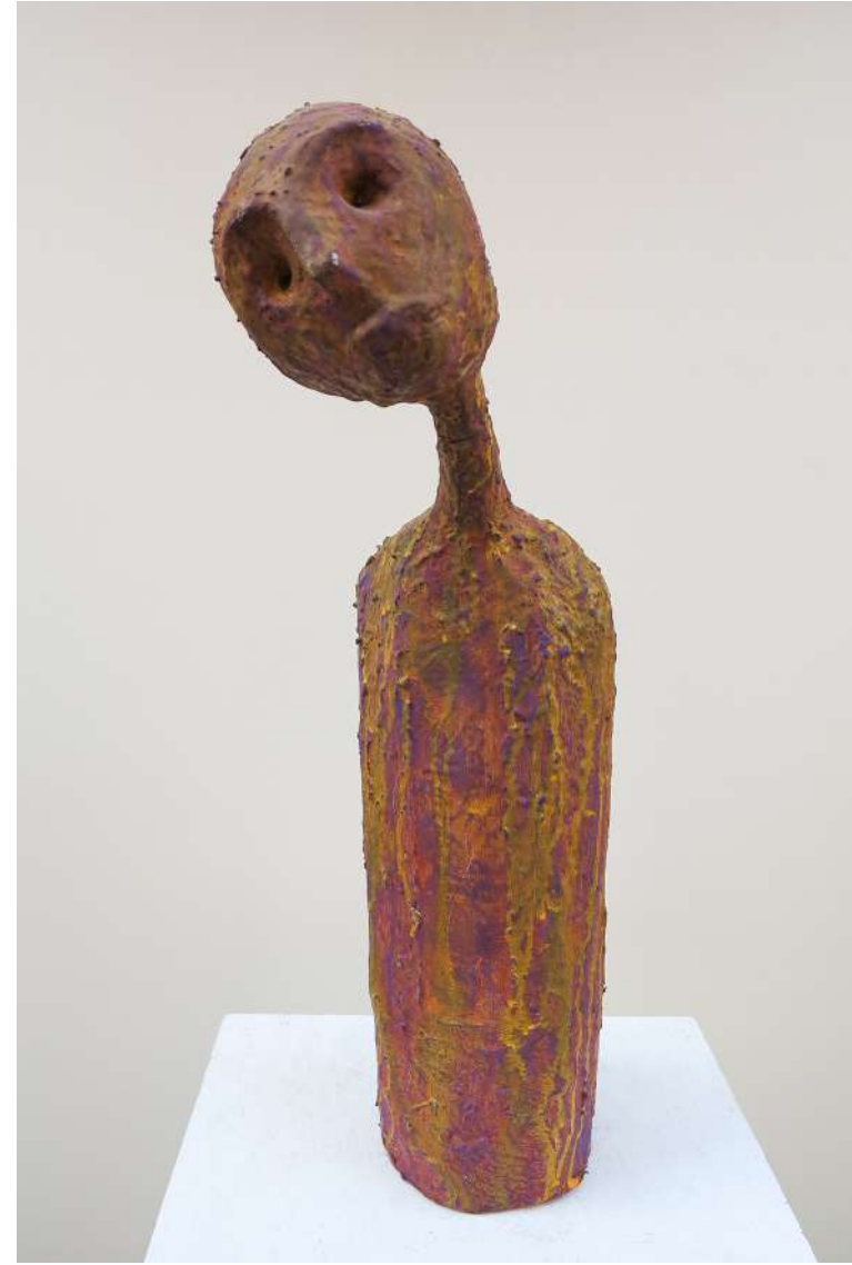
CHILD UNDER THE RAIN Fiberglas | 15 x 50 cm | 2018