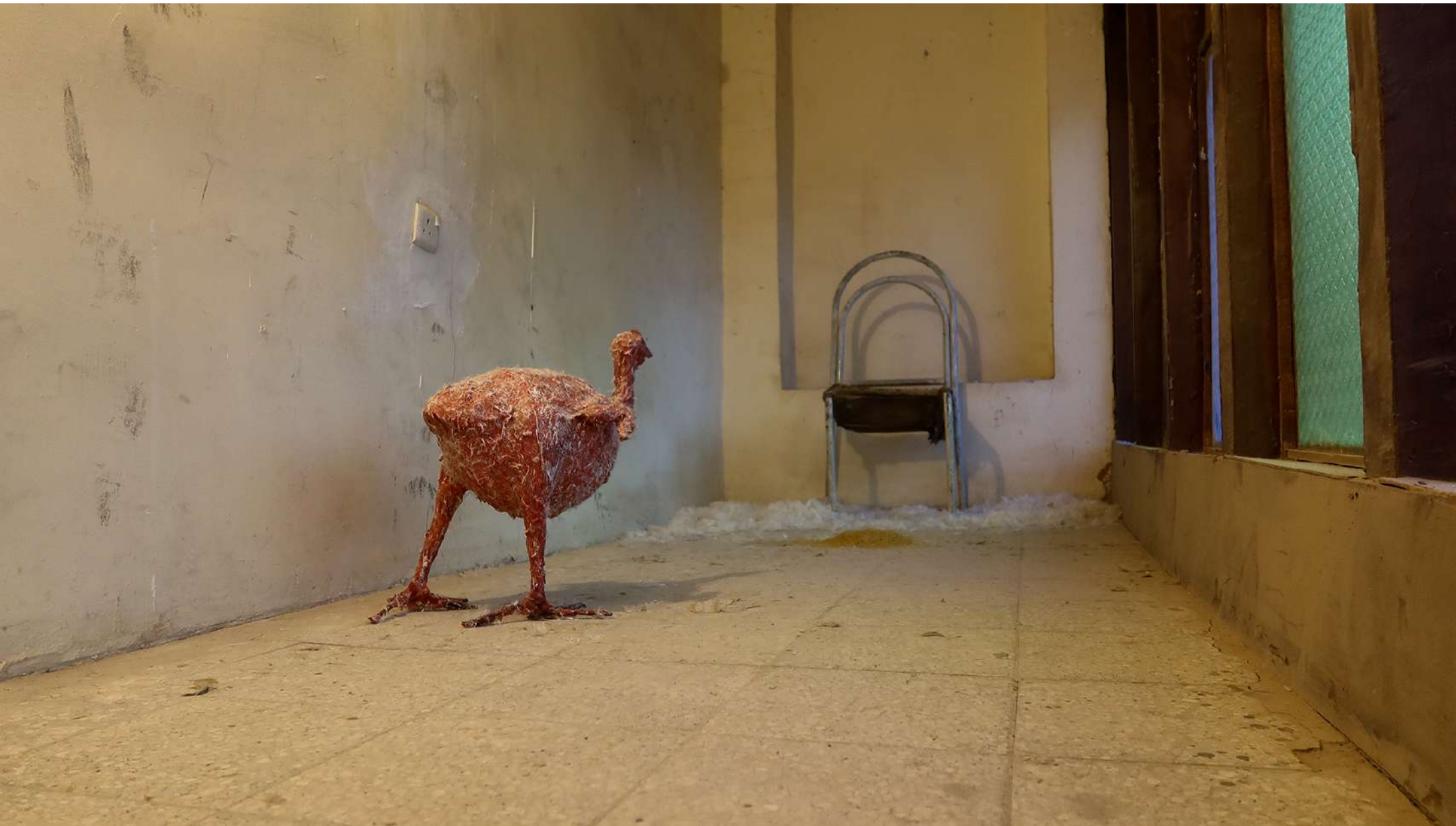
KNEELING Sculpture 2022