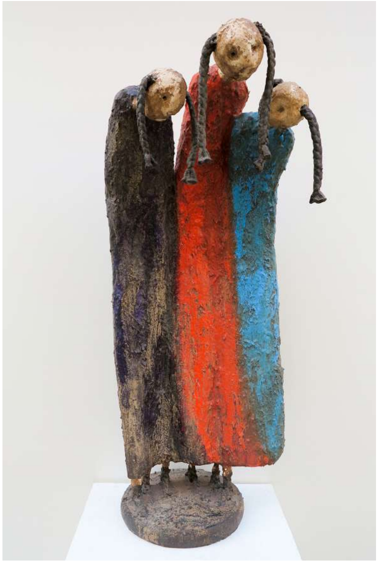
DISPLACED UNDER THE RAIN Fiberglas | 26 x 45 cm | 2018