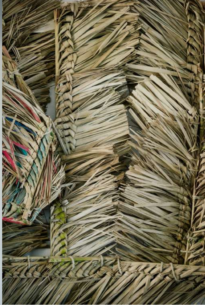
ERASE Sculpture 2020